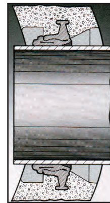
PIPE AND CONNECTOR IN SEALING POSITION